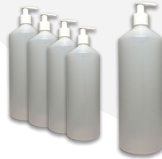
1 LITRE REPLACABLE CONTAINERS