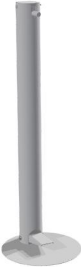
1 LITRE DISPENSER